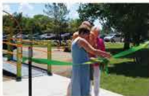
Dedication of Crotty Park Playground, June 2018

“We thought about starting our own family foundation, but the laws and process were daunting. It is much better to join with someone else. We’re glad we found the Foundation. Networking through the Foundation has helped to get the Crotty Park Playground project to be done more quickly. The 501c3 status helps people decide to donate. We also think that seeing the playground come together will help increase visibility and get more local donations.”